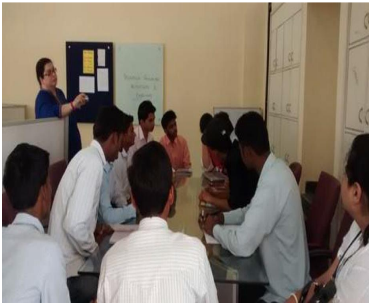
Students in interaction with staff of Lemon Tree hotels