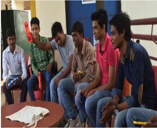
Boys during a session on Conflict management