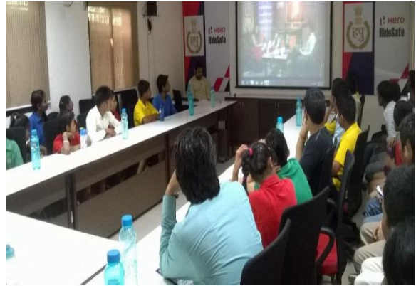
Boys during the Career Development Sessions